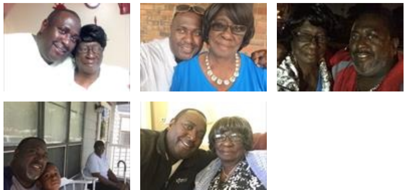
Warren Green - February 14, 2018 at 07:49 AM